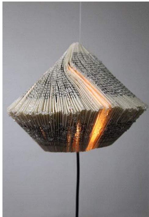
Sophia Pompéry, Light Buoy , 2014