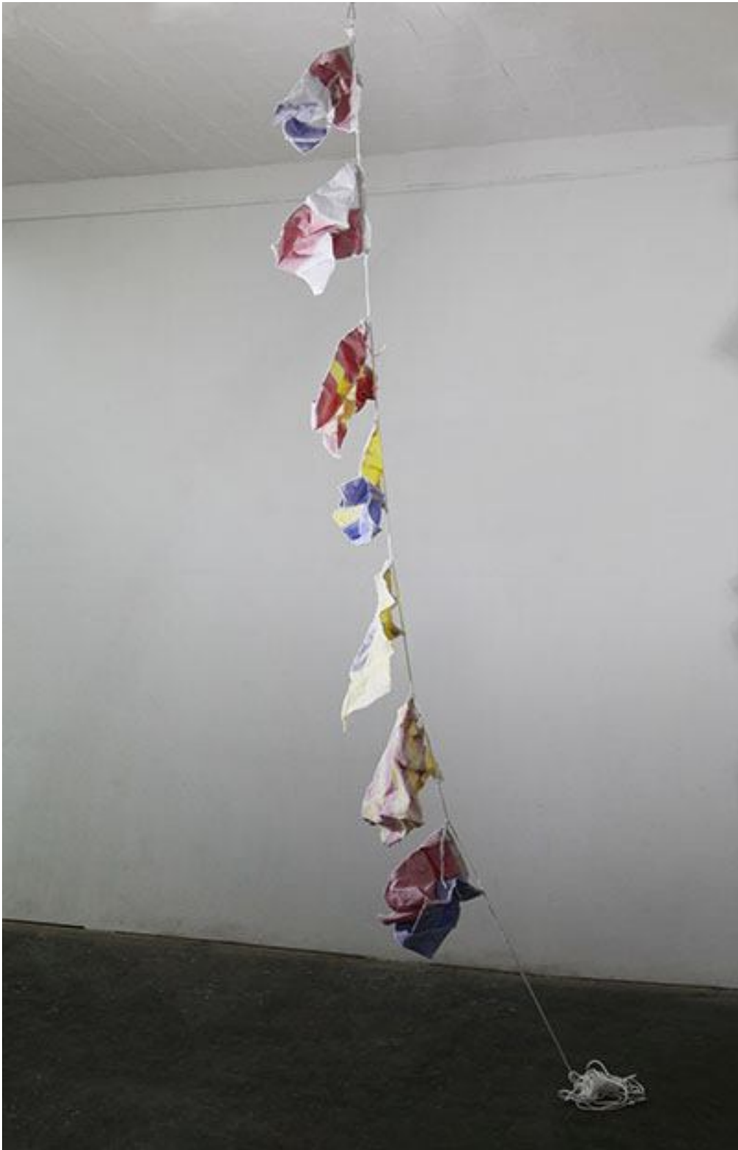
Sophia Pompéry, Halcyonic Days , 2014